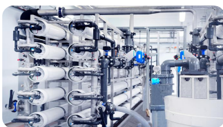
Desalination Sea / Brackish Water