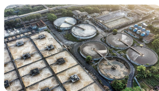
ZLD / MLD Wastewater Treatment